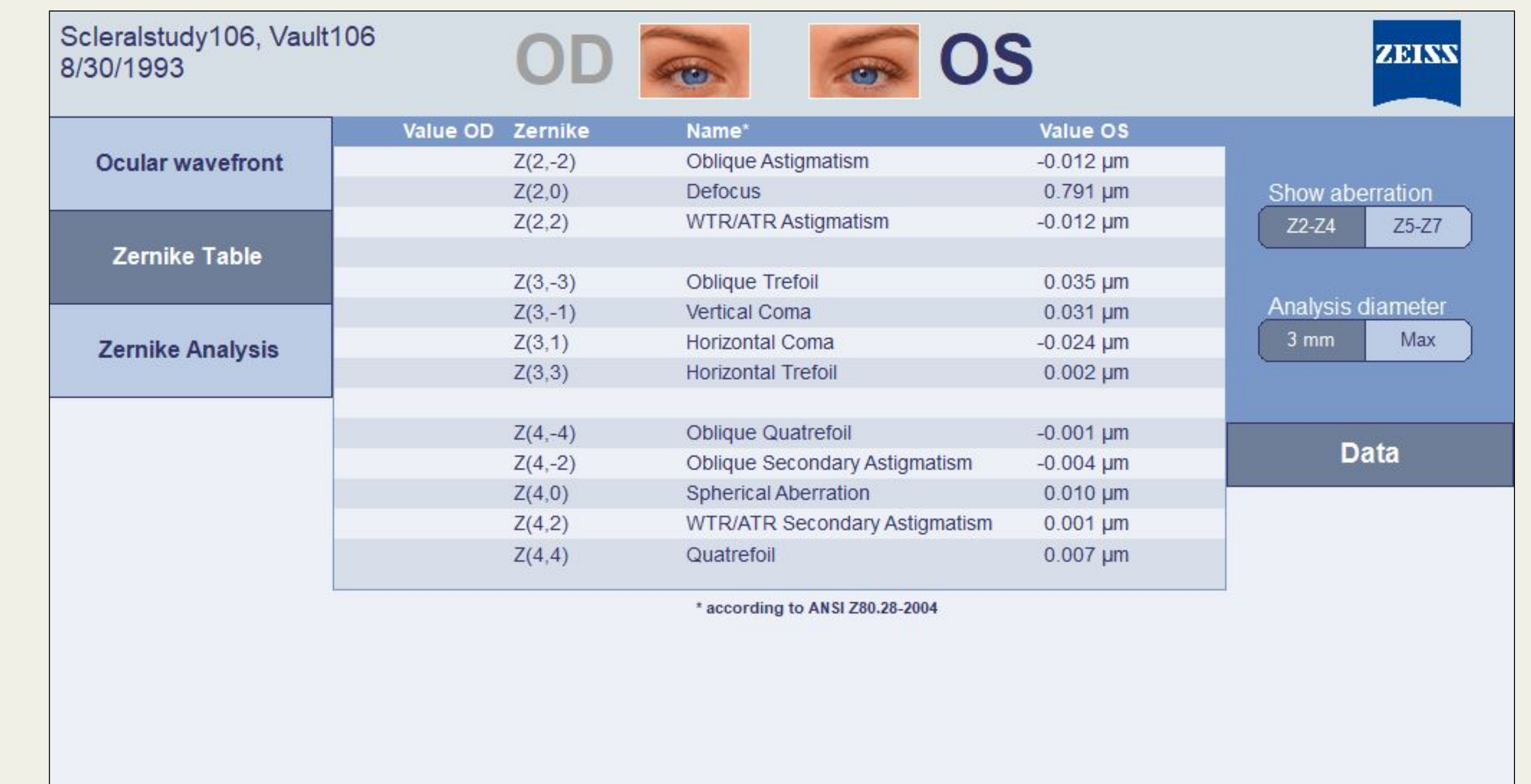
IMAGE 2. iProfiler® Zernike Table with HOAs (orders 2-4; 3.0-mm pupil shown).

As altering corneal vault does not induce an increase in HOAs, corneal vault is yet another variable for clinicians to utilize to provide an accurate, comfortable scleral contact lens fit for both regular and irregularly shaped corneas.